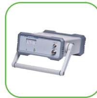
PA6002 Amplifier 15W