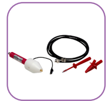
Complete System Connectivity Essentials