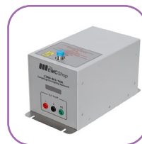
CDM M3 Coupling/ Decoupling