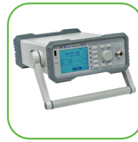
PMM 3010 RF Generator

At APC, we understand that some applications require more than a standard configuration. While the COND-IS/10 represents a proven, ready-to-deploy solution, our EMC Test Solutions team is fully equipped to design bespoke or tailored variants to meet specific testing requirements. Should your project demand a customised approach, we will work closely with you to ensure the system aligns precisely with your needs.